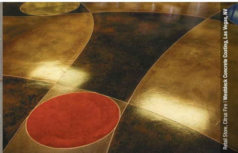
Retail Store, Citrus Fire | Westdeck Concrete Coating, Las Vegas, NV

Concrete Solutions® Metal Fusion is an elegant metallic epoxy system designed to offer a seamless, showroom-like finish for concrete floor and countertop surfaces. Its three-dimensional look gives ordinary concrete extraordinary color and depth.