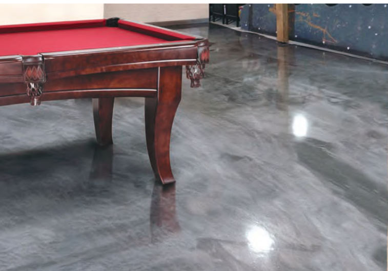
Residence, Sterling & Storm Gray | RLC Concrete Coatings, Columbus, IN