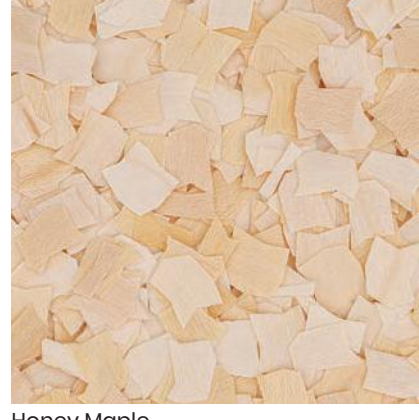
Honey Maple W1010