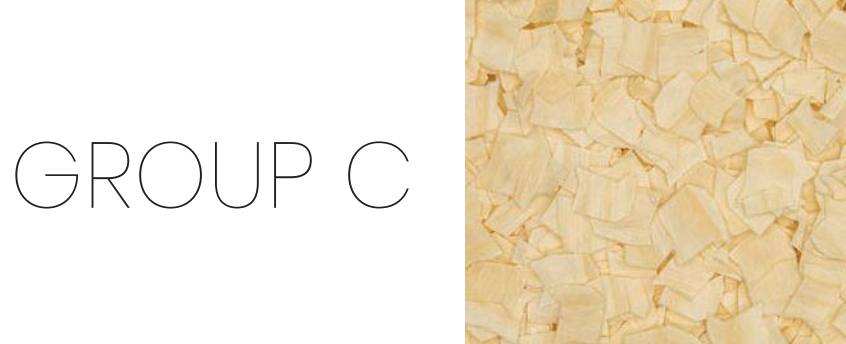
Powdered Aspen W1000