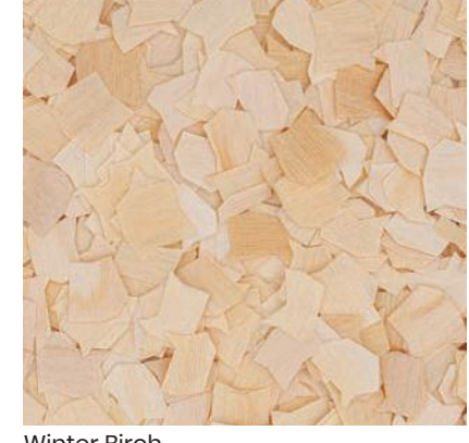
Winter Birch W1015