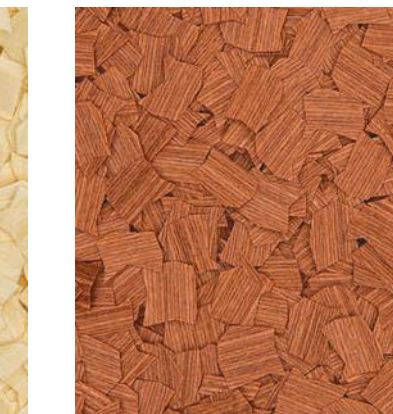
Classic Mahogany W1040