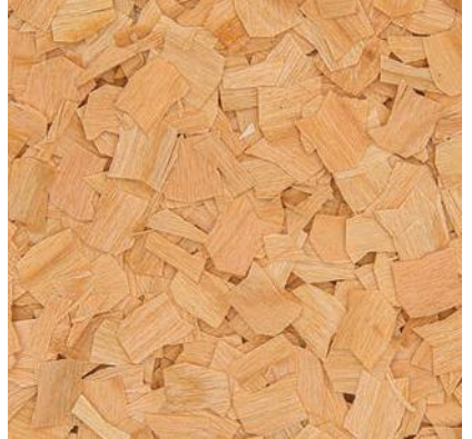
Wild Cherry W1020