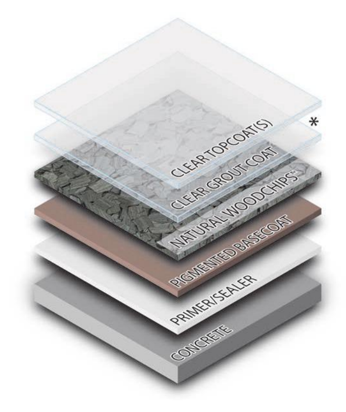
*For best results, a sanding coat is recommended prior to applying the final topcoat(s).

This innovative wood flooring solution combines the hygienic benefits of seamless flooring with nature's elegant wood grains, sustaining a timeless appeal for the life of your floor.