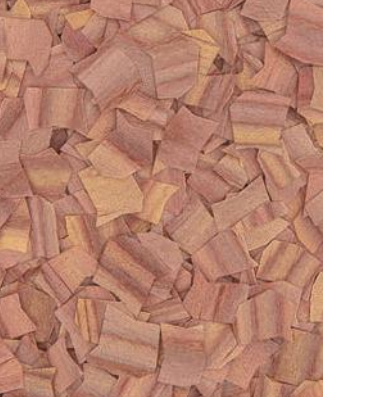
Eastern Red Cedar W1050