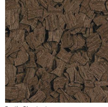
Rustic Chestnut W2140