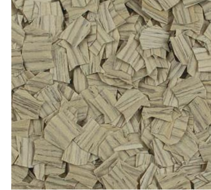
White Ash W2010