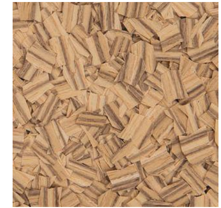
Natural Zebrano W1070