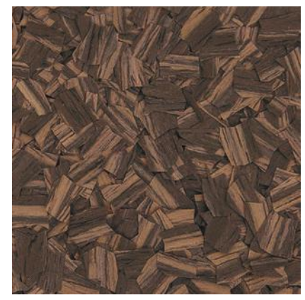
Charred Ebony W1080