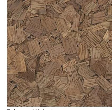
Tobacco Walnut W1090