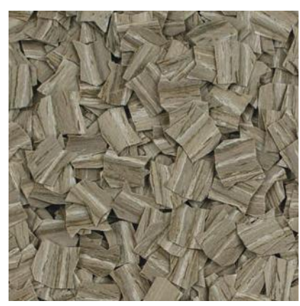
Aged Hickory W2015